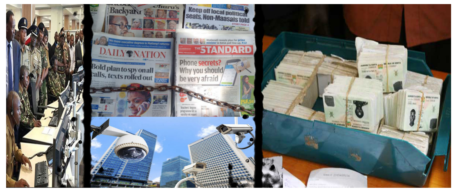
1.The Digital ID Card

A Society-wide Access-Controlled Prison-System Complex