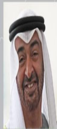
Abu Dhabi Crown Prince Mohammed bin Zayed