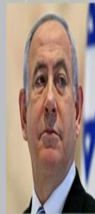
Israel's Prime Minister Benjamin Netanyahu

Egypt signed a peace treaty with Israel in 1979