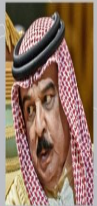
King of Bahrain Hamad bin Isa Al Khalifa