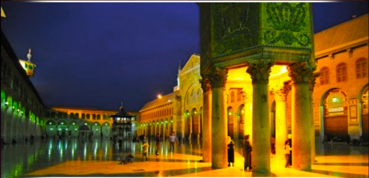
Bayt al-Maal in Umayyad Mosque Damascus, Syria

Hanzalah Ibnu Sayfi, a clerk to Rasool Allah (saw), reported: “The Messenger of Allah (saw) said to me: “Accompany me and remind me of everything, for no later than three days.” He said: ‘so I kept on reminding him for three days about any fund or food or any money I received.’ So the Messenger of Allah (saw) would not spend the night except after the disposed of everything.” Most of the time, the funds used to be distributed on the same day. Al-Hassan Ibnu Muhammad reported Rasool Allah (saw) never used to keep any fund till late in the day or overnight, “i.e. if he (saw) received it in the morning, he would distribute before noon, and if he (saw) received it in the evening he would spend it and would not keep it overnight.”